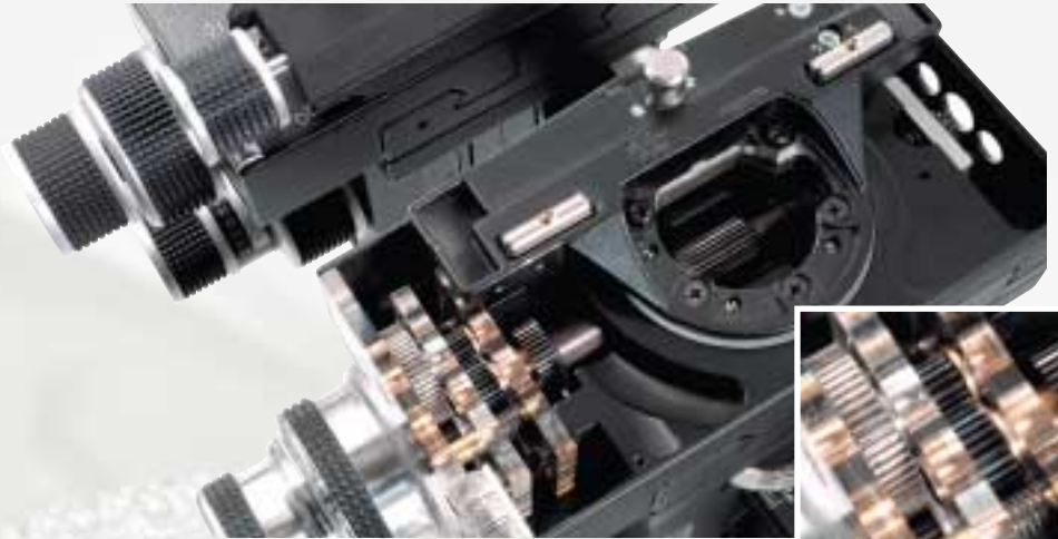
Self-locking, highly precise mechanisms for exact settings.

True to the tradition of the Sinar p line of view cameras, the Sinar p3 too, is equipped with highly precise mechanisms. In keeping with the requirements of digital photography, the dimensions of the new camera have been significantly reduced without sacrificing any of this traditional precision. The yaw-free camera with the proven segment swings and tilts and the asymmetrical swing and tilt axes permit an easy and exact positioning of the plane of sharpness. This ease of working is especially significant in digital object photography with high precision requirements. The self-locking fine drives keep the camera's standards exactly in the chosen position. The generous adjustment ranges, independent of one another, of the image standard and the lens standard (vertical and horizontal shifts as well as swings and tilts) provide the photographer with a maximum of creative freedom.