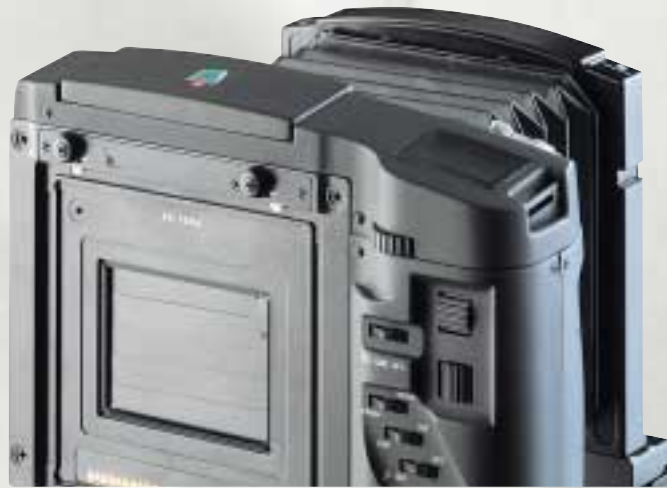
Sinar m: High-precision focal plane shutter with 1/2000 th of a second shutter speed for the fastest professional view camera of all time – ideal for outdoor photography.

The Sinar m can be powered using either an external mains supply or by connecting it to an optional battery pack. In combination with the Sinar p3 and these accessories, the Sinar m constitutes the perfect system for even the most demanding jobs, in the studio or on location.