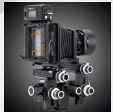
Thanks to its compatibility with Sinar System components, the Sinar p3 can also be used with conventional film.