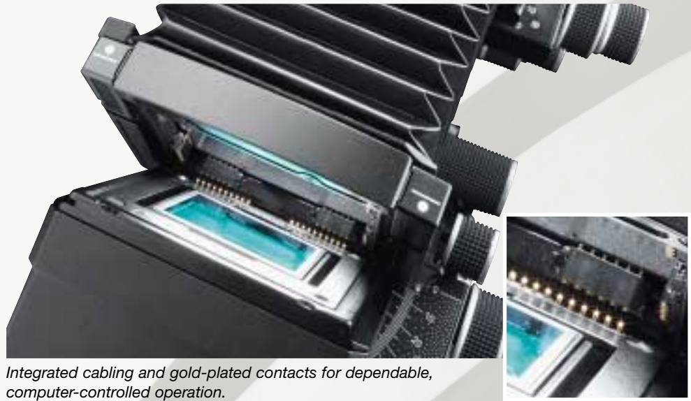
Integrated cabling and gold-plated contacts for dependable, computer-controlled operation.

The Sinar p3 has been tailored uncompromisingly to function with Sinarback high-end digital backs. For this reason, electrical contacts have mostly been integrated into the camera, and the number of cables required reduced to a minimum. Depending on the type of Sinarback used, data transfer is carried out either via a modern firewire connection, or via a well-proven fiberoptic connection. This way the Sinar p3 is well-equipped for use both in the studio and also, in combination with a Notebook, on location. Combined with the optional Liquid Crystal Shutter, the live image allows perfect focusing with maximum ease.