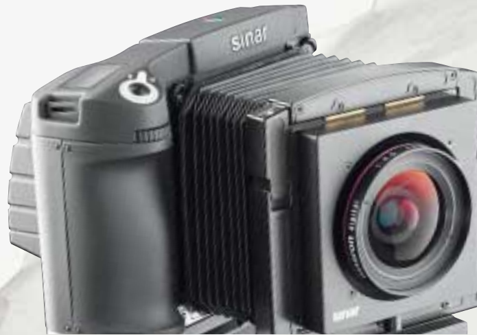
Sinar m: Professional camera shutter controlled either by software or by the integrated display.

The Sinar m can be seen as a follow-up model in the successful Sinarcam series. It provides a modern behind-the-lens shutter system for the use with the Sinar p3. The camera functions can be controlled either via the display on the Sinar m or using the Sinar CaptureShop™ capturing software. Sinaron Digital Lenses built into the new, fully electronic Sinar auto aperture mounts (CAB) can also be operated using either the controls on the Sinar m or the capturing software. This is a considerable advantage for the user, particularly when the camera is in a raised position.