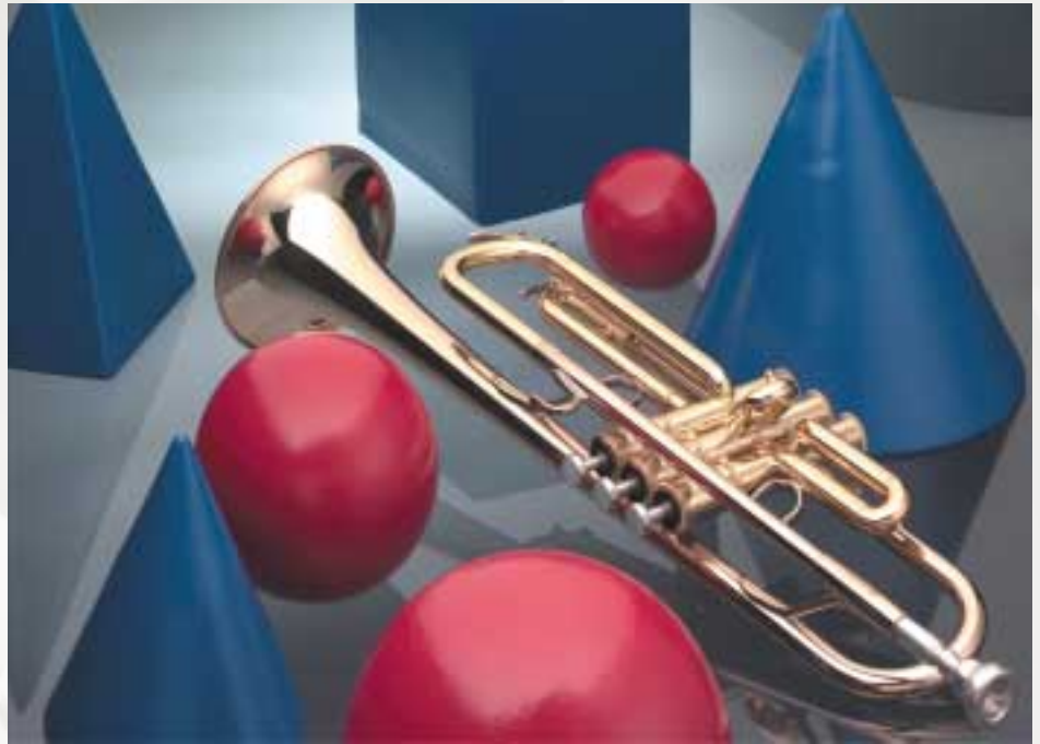
Difficult subjects, photographed in sharp focus and with perspective correction, prevent complex and costly subsequent manipulation.

The Sinar p3 camera is compatible with current and future Sinarback digital backs. In order to satisfy diverse requirements, Sinarback models are available with different sensor sizes and resolutions. The addition of a Sinar Macroscan provides a major increase in resolution and, thanks to the greater imaging surface, an optimal benefit from the adjustment capabilities of the camera.