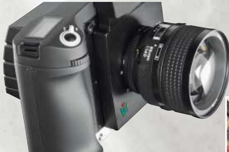
Sinar m: Extendable to become a medium format or 35 mm camera. With electronically controlled mirror modules – ideal for digital photography.

Microprocessors in all modules ensure that the components interact perfectly, guaranteeing the highest precision and reliability.