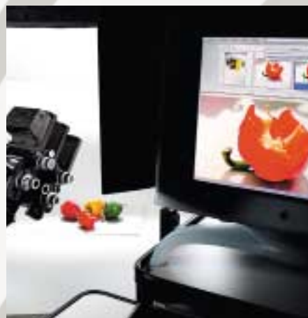
A tidy working area in the studio, optimized for digital photography.

The Sinar system is completed by a vast choice of components and accessories, which ensure that, even in years to come, your camera will still be the newest and best available.