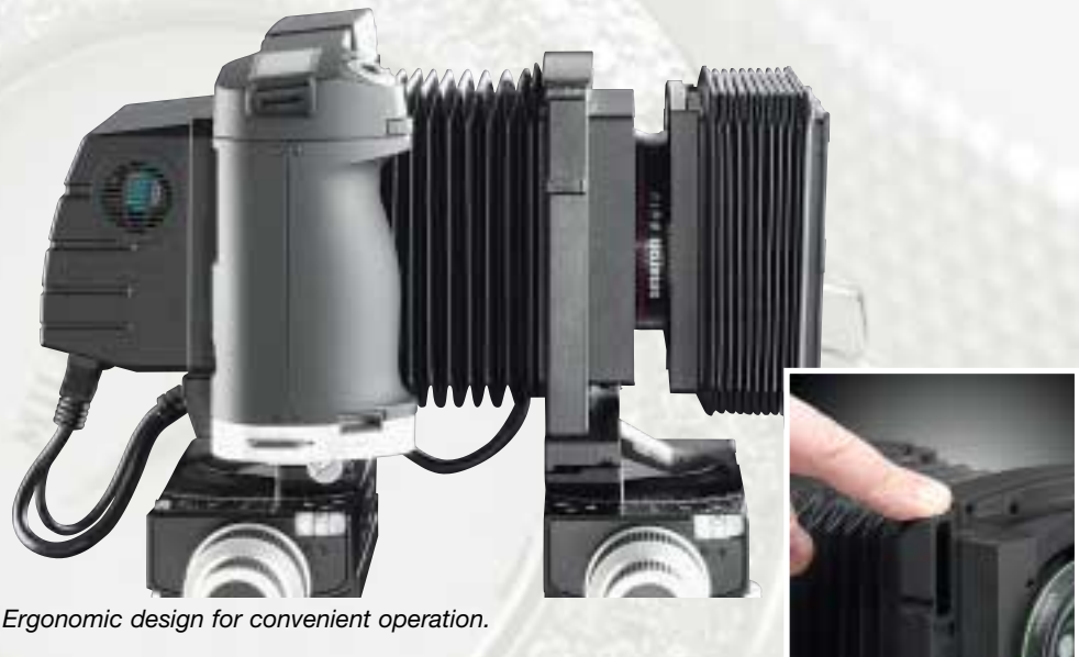
Ergonomic design for convenient operation.

All the operating elements of the Sinar p3 camera are tailored to the size and the strength of the human hand. The ergonomic location of the operating elements makes precise and efficient work possible even in a darkened studio. In addition, snap locks on the elegant carrier frames permit quick and secure changes and adjustments of lenses, bellows and digital backs, thus enabling the photographer to concentrate entirely on the photograph itself.