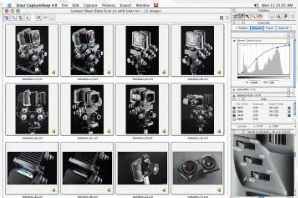
Computer-aided operation for perfect multi-shot exposures with the greatest color fidelity and resolution.

SINAR AG CH-8245 Feuerthalen/Switzerland Telephone +41/52 647 07 07 Fax +41/52 647 06 06 E-mail sinar@sinar.ch Website www.sinarcameras.com