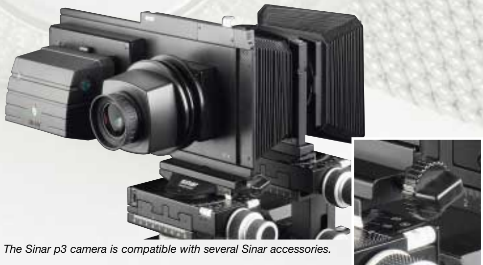
The Sinar p3 camera is compatible with several Sinar accessories.

Of course the Sinar p3 camera too, is compatible with the Sinar System. Thanks to the extensive line of accessories, the modularly designed Sinar p3 can be tailored optimally to photographic tasks and to the needs of the photographer. An auxiliary standard designed specifically for the Sinar p3 serves for the use of long extensions. The optional sliding adapter permits the use of a focusing screen in addition to the live image on the monitor screen. Roll- or sheet films can also be exposed by means of the 4x5" metering back.