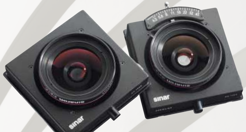
High-resolution Sinaron Digital lenses perfectly matching the requirements of digital photography in a compact design.

Used in combination with the Sinar p3, with or without the Sinar m, the lenses can be built into compact, electronic between-the-lens shutters with shutter speeds of up to 1/60 th of a second and manual aperture control (CMV). Lenses in this mount are available from 28 to 150 mm.