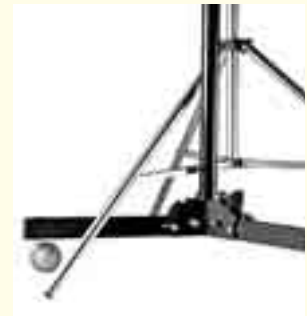
Low profile for easy positioning in the studio.