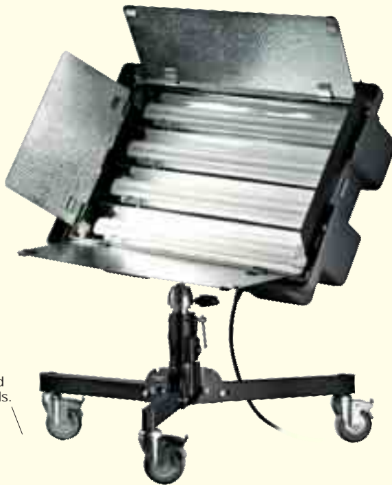
All stands are equipped with free running wheels.

Practical and quick positioning of light fixture.