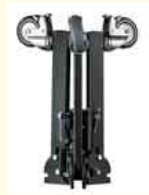
Quick action folding legs.

Aluminium versions Electric welded aluminum tubing for higher mechanical performance and reduced weight.