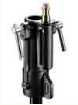
28mm (or 16mm) die cast aluminum socket and 16mm stud.