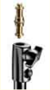
17,5mm female attachment plus spigot.