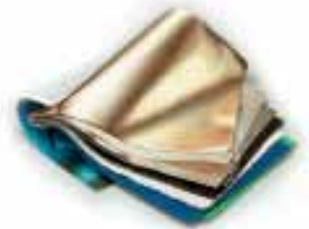
Fabric swatch book. Code I999.