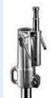
28mm (or 16mm) socket or 5/8" + 3/8" stud.

Chilled top fixing for extra performance.