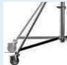
All models feature leveling leg.